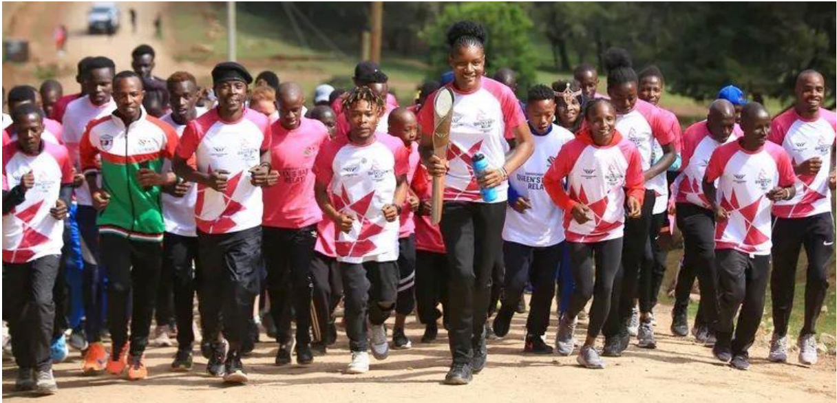
Queen's Baton in Kenya - November 2021

The Queen's Baton Relay has started its epic journey across the globe as the Baton departed from Birmingham Airport to Cyprus – which was the first stop on the 140,000-kilometre relay (which is the equivalent of completing over 350,000 laps of Alexander Stadium's running track!).